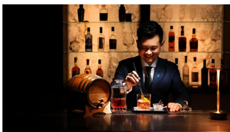
ABOVE: THE REGENT CLUB

At the Regent Club, guests will experience an exclusive sanctuary and luxury residential retreat where they can unwind, recharge and feel truly indulged in culinary, beverage and wellness offerings. This beautifully designed space on the second floor is brought to life through moments of decadence that punctuate each day.