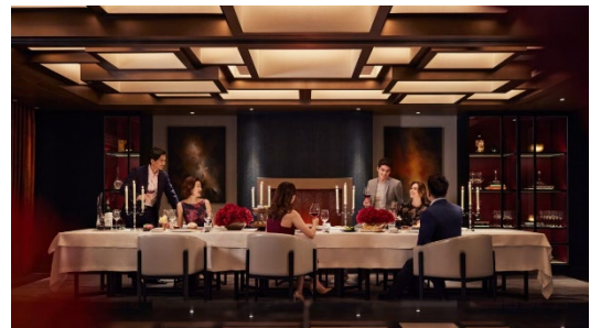
ABOVE: THE STEAK HOUSE PRIVATE DINING ROOM

Harbourside offers lavish international buffets in a lively market atmosphere, while The Lobby Lounge is a cinematic spot for afternoon tea and cocktails. Nobu brings back its iconic Japanese cuisine, and Qura , the hotel's chic bar, adds a dynamic touch, where like-minded guests gather for bespoke drinks, engaging conversations and elevated comfort food with mesmerizing harbour views and a fine selection of cigars in the humidor room.